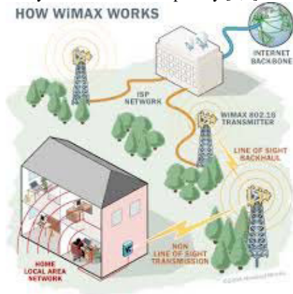
Figure 1. Wimax Conceptual view

able to utilize power efficiently in order to deliver optimum Functionality. For WiMax, the output power usage is based on a ranging process that determines the correct timing offset and power settings. Therefore, the transmissions for each subscriber station are supposed to be such that they arrive at the base station at the proper time and at the same power level. When WiMax is deployed outdoors, in non-line of sight environments it may encounter delay, which can cause potential inter symbol interference. Though the use of scalable orthogonal frequency division multiplexing (SOFDM) is meant to try and alleviate this problem, OFDM usage has the problem of generating phase noise, which increases the RF subsystem cost and complexity [8,9].