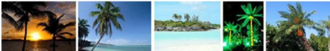
Fig.No. 2. All the images shown in this figure are related to palm trees. They are different in color, shape, and texture.

Our experiments show that the semantic space of a query keyword can be described by just 20 \square 30 concepts (also referred as “reference classes” in our paper). Therefore the semantic signatures are very short and online image reranking becomes extremely efficient. Because of the large number of keywords and the dynamic variations of the web, the visual semantic spaces of query keywords need to be automatically learned. Instead of manually defined, under our framework this is done through keyword expansions.