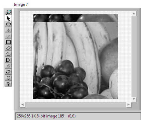
Fig.6 Received Image using EZW coding using Maximum Power Adaptation Method