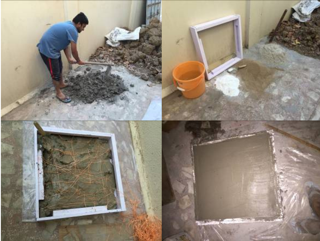
Figure: - Mortar casting