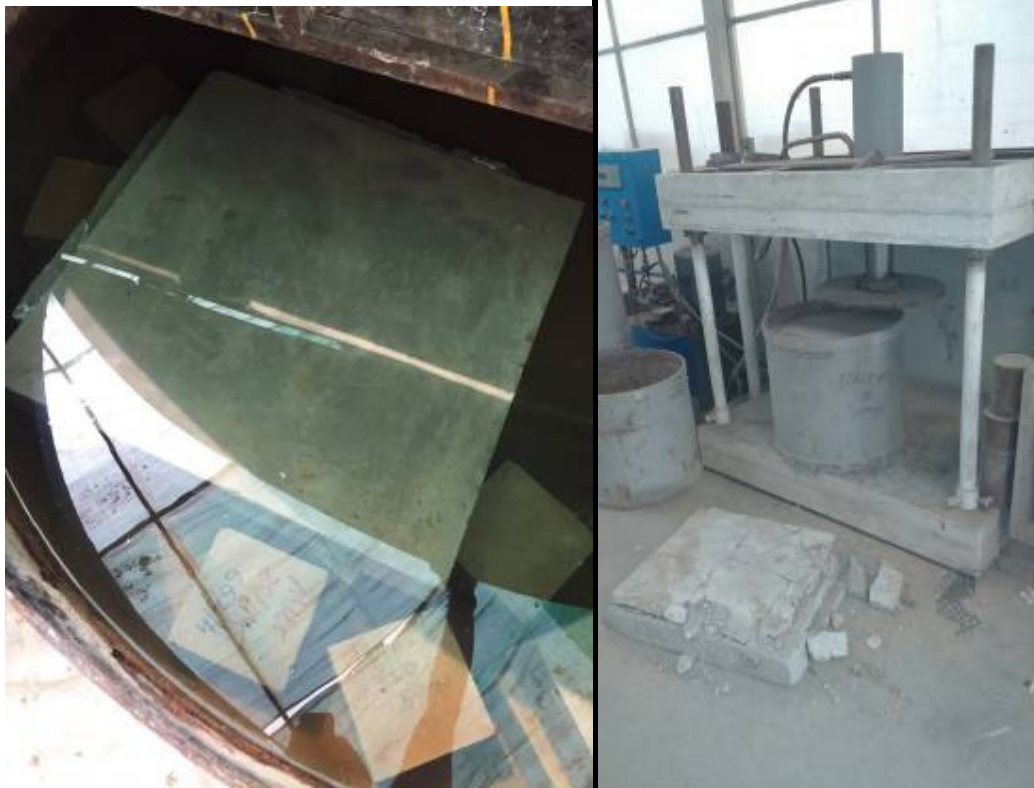
Figure 5.1 Water absorption and Compressive strength

We got 4.1 N/mm 2 compressive strength, which is higher than the conventional type of brick or fly ash brick. We achieved higher strength; it is encouraging to develop the low cost housing projects by this clay wall. Higher percentage of water absorption gets result in decrease the strength. We got 12% of water absorption, which is lower than the conventional brick. We got 1500 kg/cm 3 density, which is lower compare to the conational brick or fly ash brick. Lower density gets result to obtain low weight. Above tests result fulfil the requirement based on our aim or objective of research work.