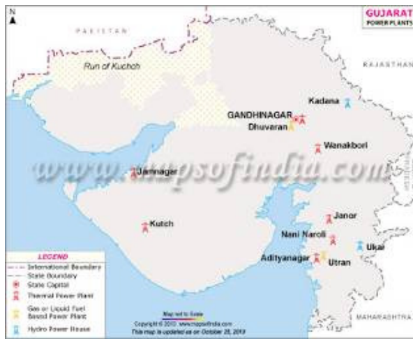
Fig. Gujarat thermal power plant