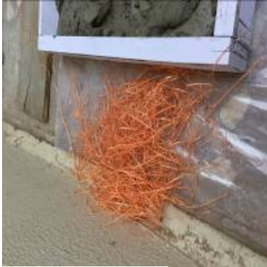
Fig. Cement bags fibers