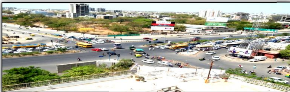
Fig. 1 Aerial view of study area