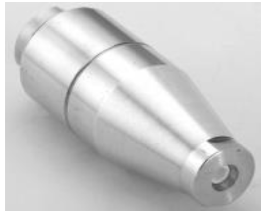
Fig : Nozzle