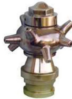
Fig : Spherical Multi-Nozzle Fire Extinguisher

Interior structure firefighting is now becoming more challenging and dangerous than in the past. Many new buildings, such as commercial centers, galleries, exhibition halls and warehouses, are becoming bigger and more complex. These buildings have big open indoor areas containing extensive volumes of combustion gas once a fire occurs. Also, the extensive use of new materials for building construction and contents can result in increasing smoke productions and more rapid flame development once they ignite. The use of new construction technologies, such as the widespread installation of double-glazed, energy-efficient windows, that allow hot smoke to be contained in the room for an extended period, also adds to the challenges for firefighting. Conventionally, water has been used as an efficient agent in controlling a fire and minimizing its spread. There are two traditional fire-attack methods, namely, direct and indirect