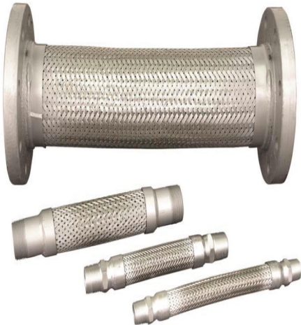
Fig : Flexible braided hoses pipe

Flexible braided hoses for gas, oil, steam, compressed air and oxygen service are ideal for applications requiring a high degree of flexibility with tightness and protection against bursting. They are used in piping systems to neutralize problems caused by vibration, thermal expansion, piping alignment and to accommodate motion. 8773 hoses are selected for use to accommodate angular, axial, offset, radial and random motions.